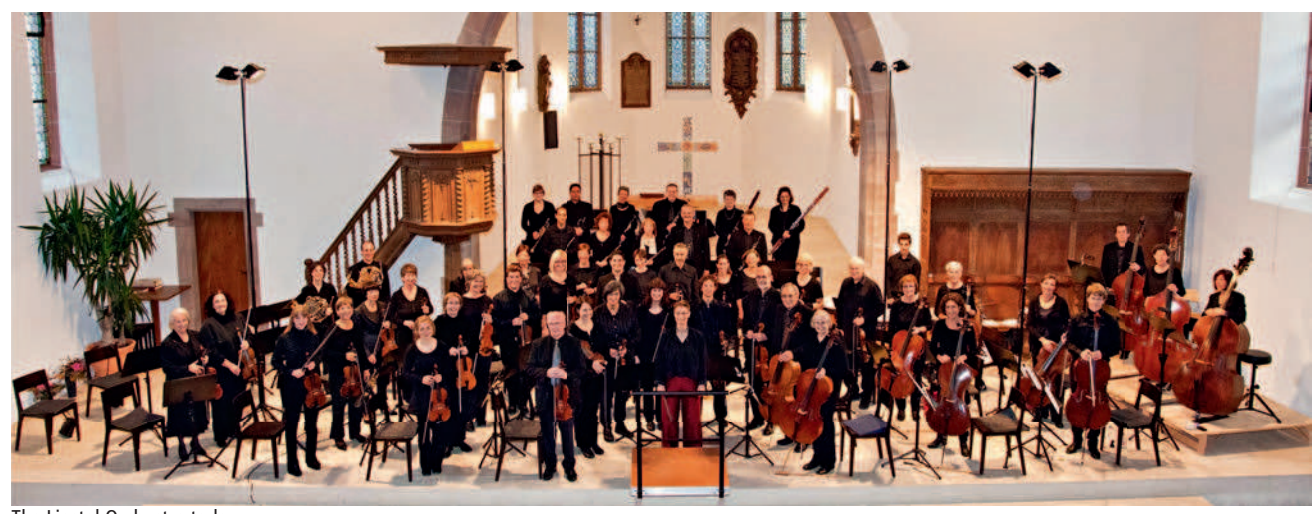
The Liestal Orchestra today

Each year, programmes are selected by the conductor and music committee to maintain a balance between classical and modern styles. As well as playing famous popular pieces, the orchestra likes to try out lesser-known